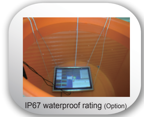
IP67 waterproof rating (Option)